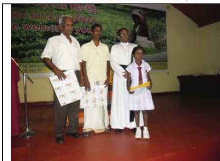
Grade 5 Scholarship Pass Students

Activity 1-3-1 "One non formal teacher employed at Estate level-St.Margeret Estate-Non formal schools,(32 students)