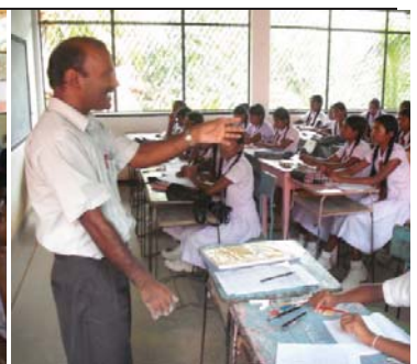
2012 G.C.E O.L Math's Class