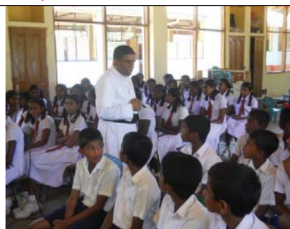
Life Ordination Programme