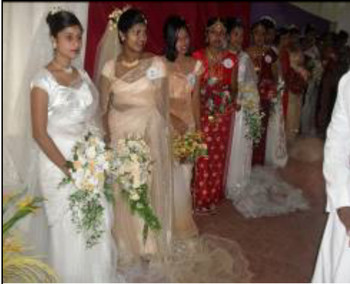
Bridle show by Beauty Culture Students