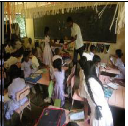
Seminar for Grade 05 Scholarship Examination