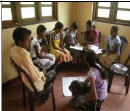
Education Volunteer's Training