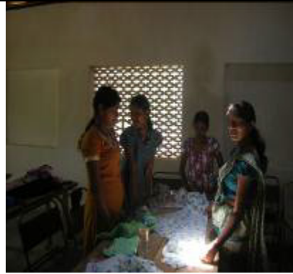
At the Sewing Class