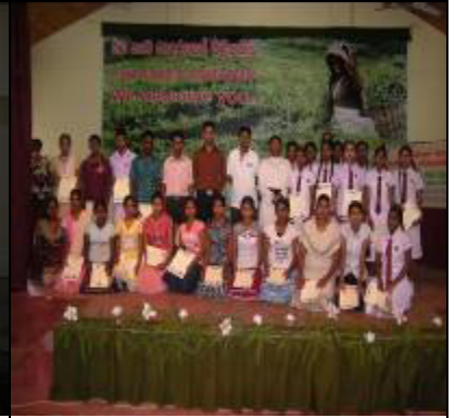
At the Certificate award Ceremony for Computer Class Students