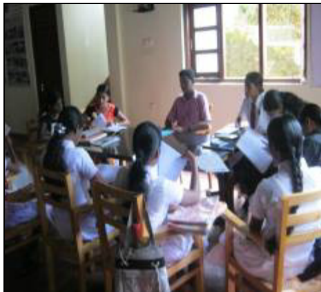
Hindu Culture Class for A/L Students

Two teachers employed during the 1st half and one teacher employed during the Second half..reason being the drop in the number of children as their Parents had gone to other estates for employment.