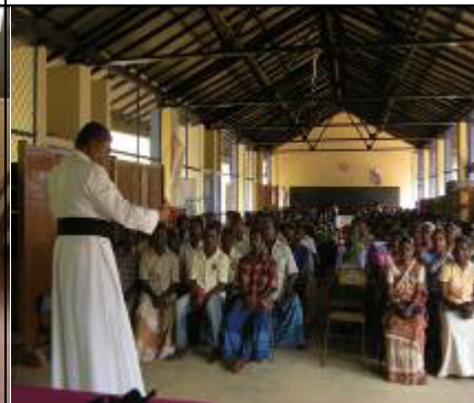
Awareness programme on Education for Parents.