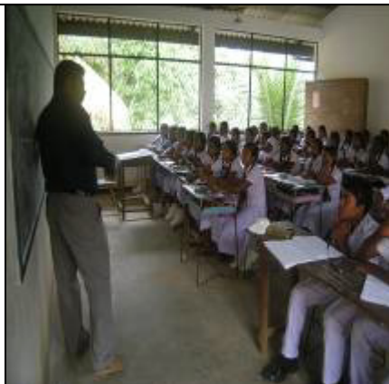
Mathematics Class for O/L Students