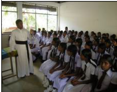
Seminar on life orientation