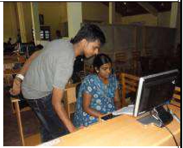
Computer Class for Youth