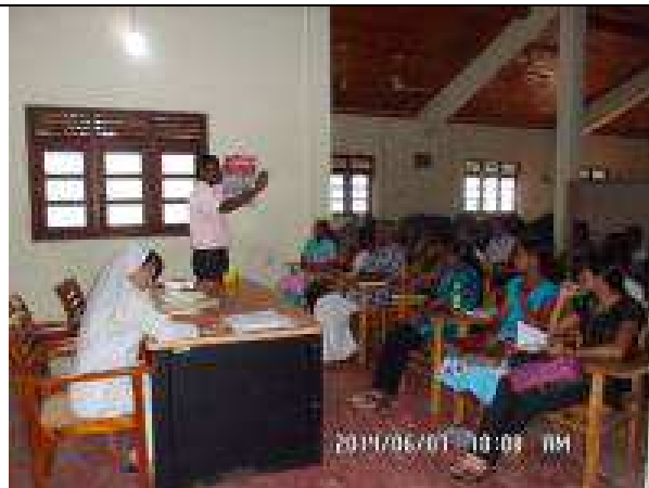
Health & Education Volunteers Monthly Evaluation Programme