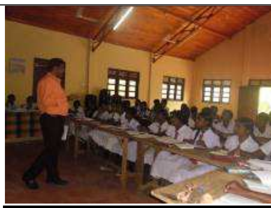
Mathematics Class for O/L Students