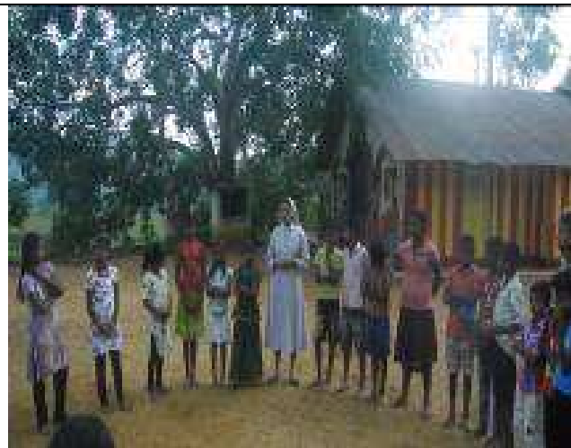
Children's Society at Selwakanda