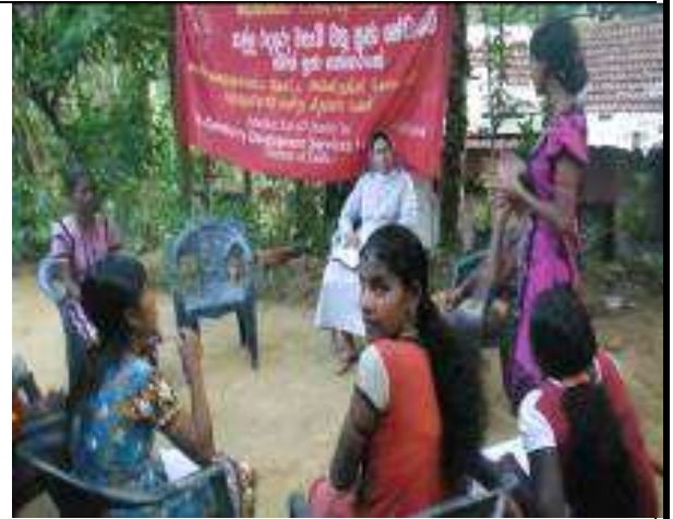
Women's Group Meeting at ST Division