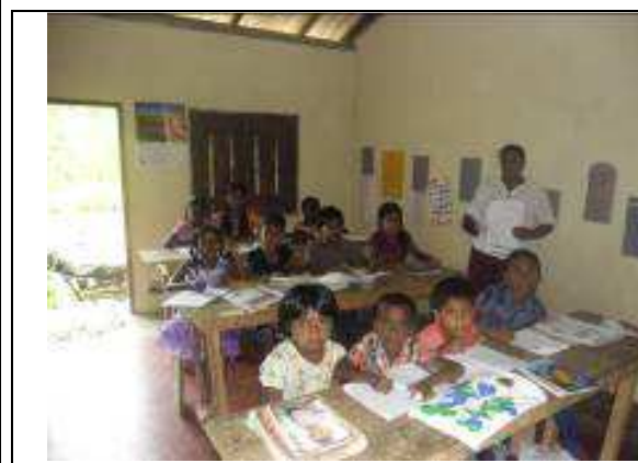
Evening Class at Enasalwatta

300 members of Children’s groups received Exercise books, Instrument boxes ,pens,pencils and erasers.