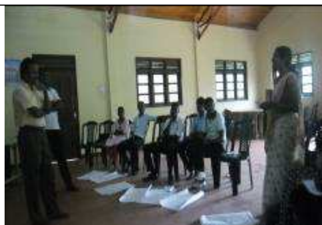
TOT on Family Spending & Saving