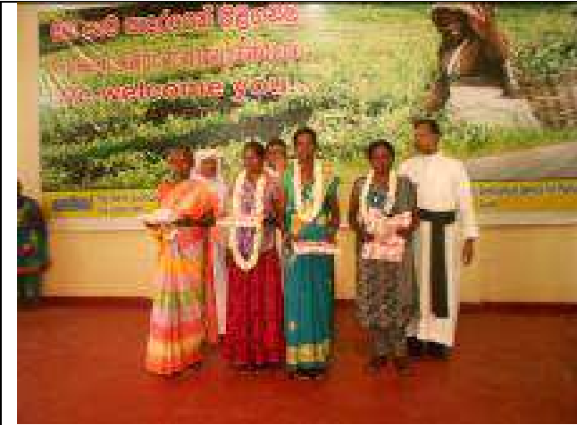
Women's Day Programme