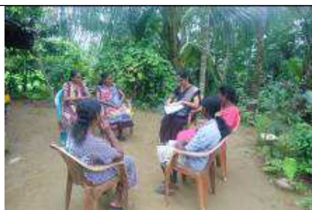
Evaluation of Past Codesep Years