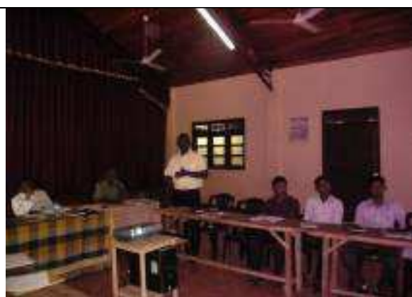
Codesep Monthly Evaluation