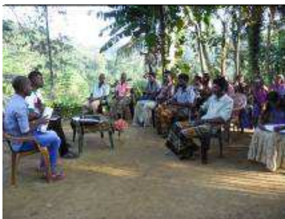
Conduct Baseline Survey