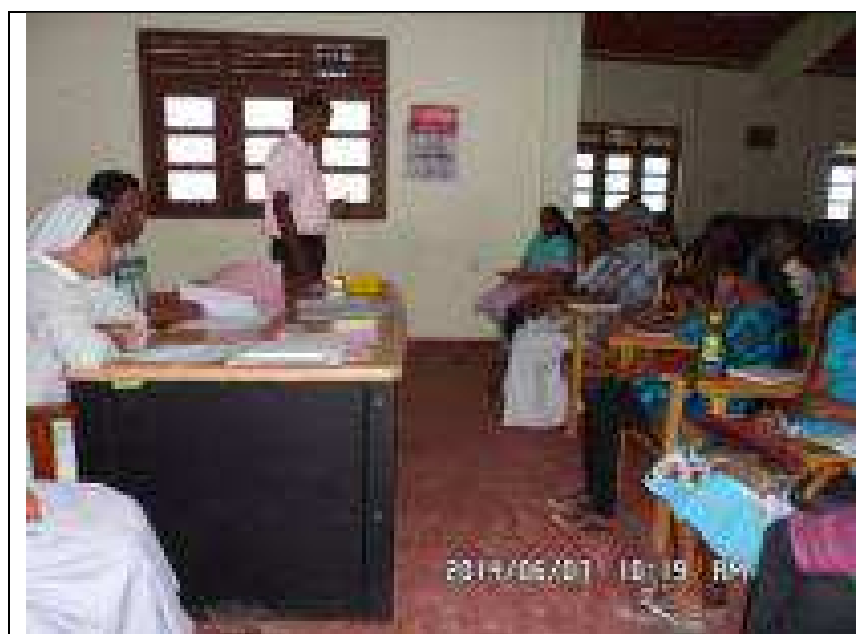
Evaluation Programme for Education Volunteers