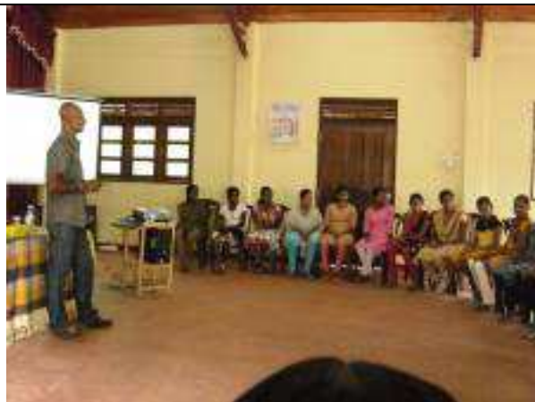
Capacity Building Training for Health & Education Volunteers

These volunteers had assisted the Animators in organizing meeting carrying out common activities and monitored cleanliness of the surroundings where the members lived, whether vaccination programmes were held on schedule and had a check on the nutrition programmes.